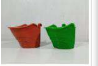
Vertical Hanging Garden Pots