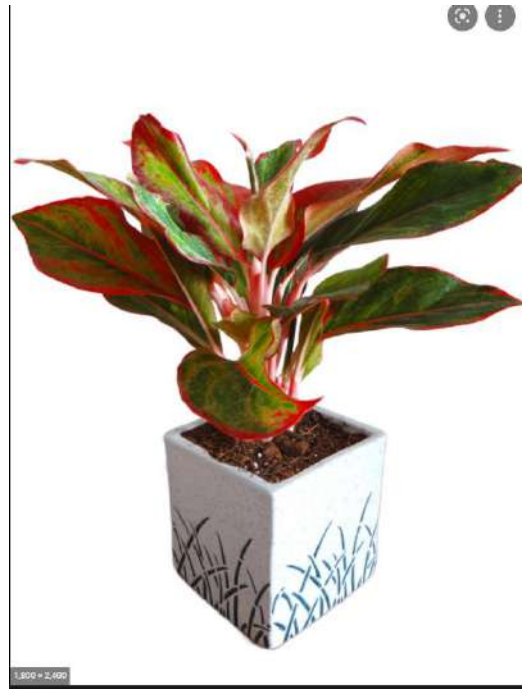
Aglaonema / Chinese Evergreen