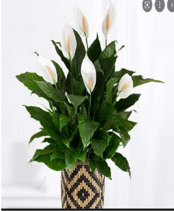
Sphatiphyllum / Peace Lily Plant