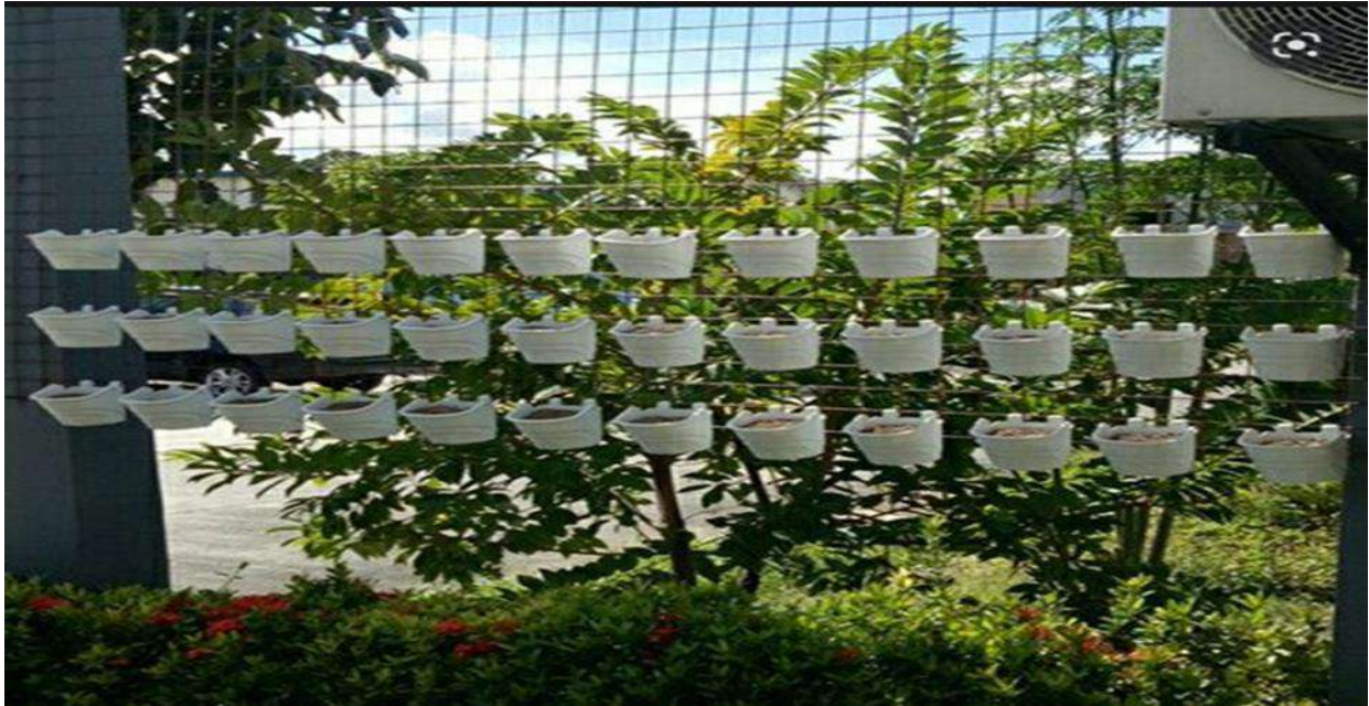
Vertical Pots green orrd or white if any